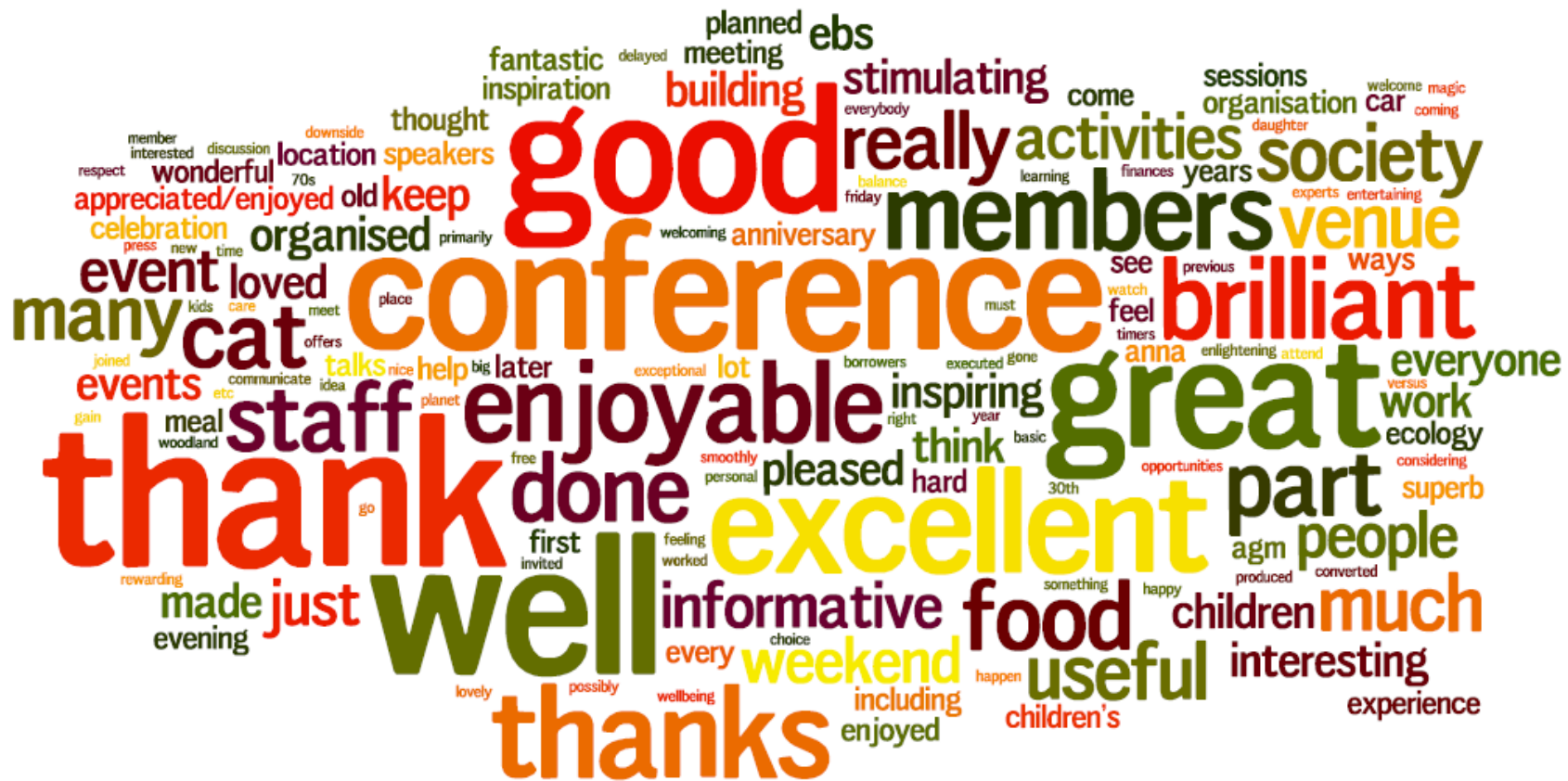
World cloud: "Do you have any other comments about the Conference?" excluding wider issues raised Size of font indicates frequency of word.