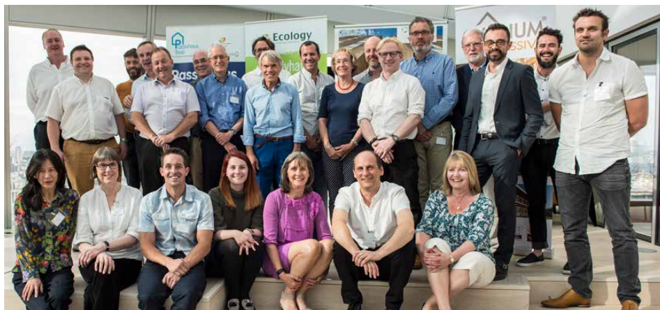
Sponsors, winners and shortlisted projects celebrating the sixth annual UK Passivhaus Awards

In 2016 we were delighted to once again support the UK Passivhaus Trust Awards by sponsoring the 'Urban' category. We joined the winners, shortlisted projects and other sponsors at the awards ceremony in London earlier this year.