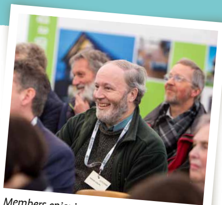
Members enjoying our AGM and Members' Meet-up

Throughout the day members had opportunities to explore our permaculture gardens and find out more about our eco-built office.