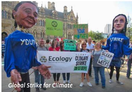
Global Strike for Climate

On Friday 20 September, millions of people from across the globe united to call for climate justice. Inspired by the youth-led school strike for climate, marches took place around the world in response to escalating environmental crises. And we're proud to say that Ecology was there. A team from Ecology joined strikers in Bradford and our CEO attended the Westminster event.