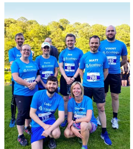
Ecology runners at the Solstice Saunter