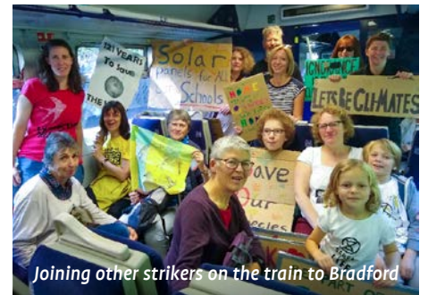
Joining other strikers on the train to Bradford

The most recent reports from the Committee on Climate Change (CCC), which advises the Government, are also far from positive.