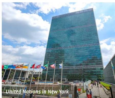
United Nations in New York

A coalition of civil society organisations, led by BankTrack, a banking sector watchdog, have expressed reservations about what the Principles will concretely deliver. We share their concerns but think that the framework they provide is an important first step for banks to plan for the risks associated with