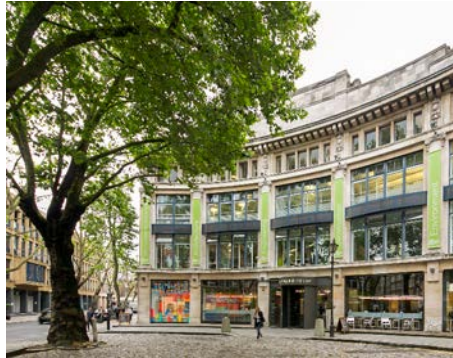
The Building Centre, Store Street, London

You can pre-register to attend the event at ecologyAGM2020.eventbrite.co.uk