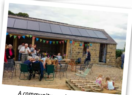
A community meal at Barnes Hall

us but has shown support throughout the process. They've given us time and understanding and have made us feel like partners committed to the same