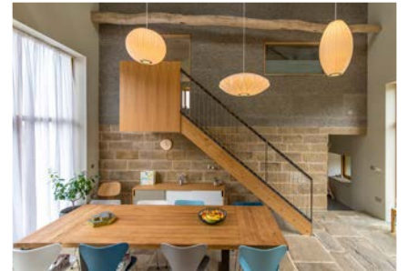
The interior of one of the new homes